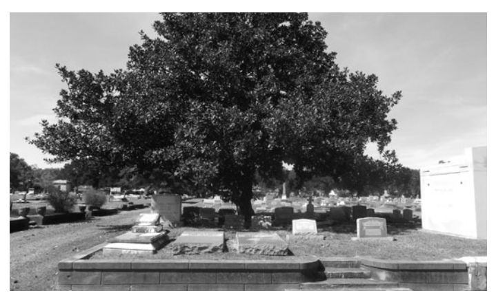
The Marechal-Murphy lot at Magnolia Cemetery.