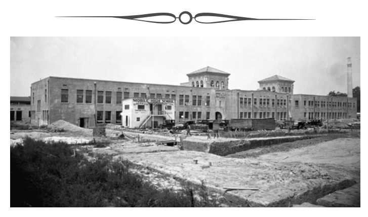
Mobilians had been clamoring for a modern high school since the start of the century. In 1925 they got their wish. Here it is under construction. It would not be renamed for Murphy until two years after its 1926 opening.

Although Barton had been enlarged in 1904 within five years its yearbook staff editorialized "We wish to register a demand for a new high school building as soon as the city or county can see its way clear to issue bonds for such a purpose. With the Panama Canal will come an era of wealth and prosperity for which we wish to be prepared. Take up the matter ye Alumni, and let the cry be on every lip: "A NEW HIGH SCHOOL."