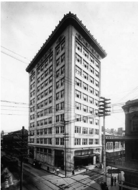
Van Antwerp Building – Mobile’s first and oldest skyscraper.

The resulting structure of fireproof “armored concrete” occupied a lot on St. Emmanuel Street mid block between