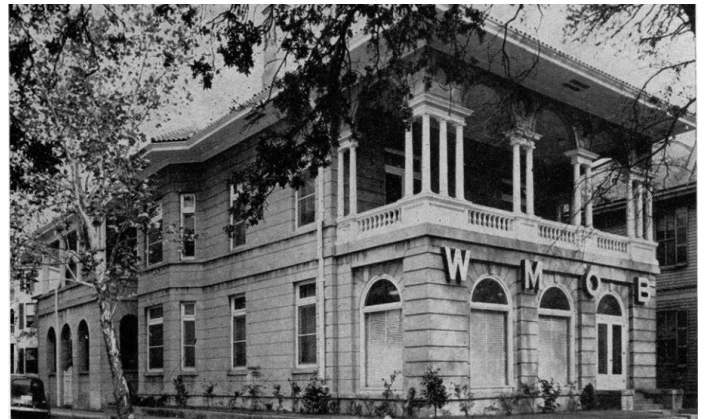
Lavretta House-still standing but largely hidden.