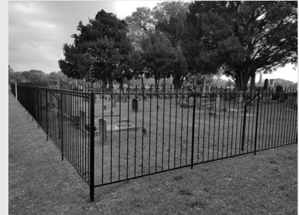
Hebrew Rest fencing is now complete.

In October our annual membership renewal drive began. I hope that you have had the opportunity to return your renewal. If it has gone astray a form appears in this issue and can also be used to give a gift membership to someone on your gift list during the upcoming Christmas season.