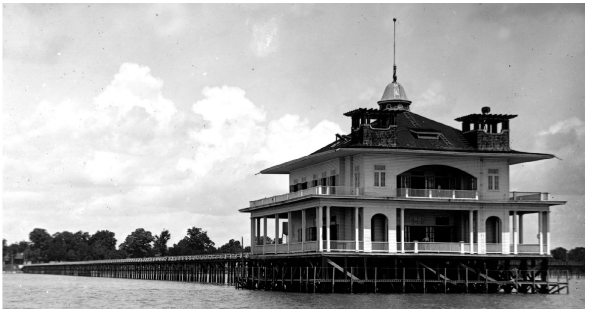
Mobile Yacht Club was reduced to its pilings in the 1916 hurricane.