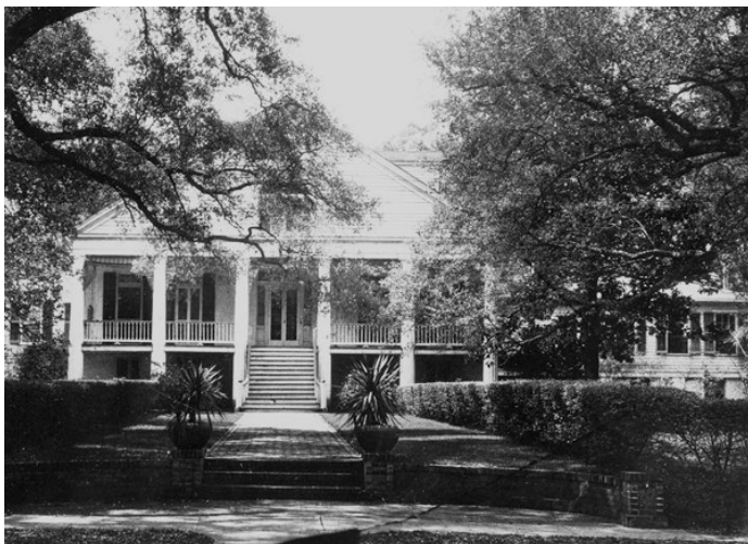
Ashland – remodeled only to be lost in a blaze.

One of Rogers' first commissions in 1903 was the overhauling of the Emanuel Building on the north east corner of Royal and St. Michael Streets. A row of mid-19th century brick buildings was combined and covered with a cream stucco façade with the corner designed to hold the Bank of Mobile. A 1904 postcard image promoting the bank notes "This bank is proof that confidence capitalizes opportunity." Despite all of that confidence, the bank failed in 1917 and the corner today is home to the Ruby Slipper Café.