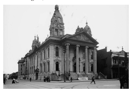
The Mobile County Courthouse as it would have appeared when the trial of the new century was taking place within its stout walls. The building was destroyed in 1955 for a replacement which later received the same treatment..