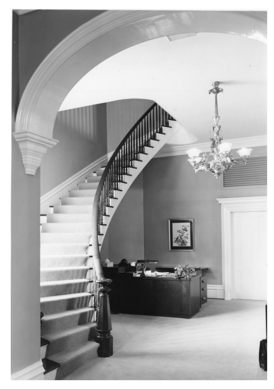
The entrance hall with its curving staircase under the ownership of Ideal Cement Company. The firm restored the house for their offices and repaired a large crack in the stair wall dating to 1865.