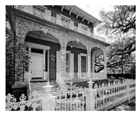
Dating to 1860 this Italianate townhouse with its outstanding cast iron fence and gallery is one of Mobile's five historic house museums.