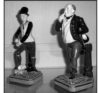
Porcelain Figures of Sam Weller and Mr. Samuel Pickwick