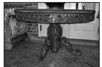
Massive Chinese Export Table in Bellingrath Home.