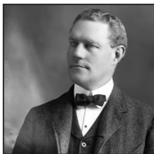
Francis Edwin Overall died in 1951 and is buried in the Overall lot at Magnolia Cemetery. Neither of his former Government Street homes survive.

City directories indicate that the Overall house vanished in the late 1950's to make way for expansion of