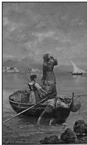
Oil Painting Of The Bay Of Naples.