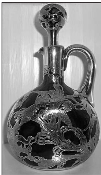
Decanter Owned By Mrs. Bellingrath.

Displayed within the Bellingrath Dining Room is a silver overlay on ruby glass decanter standing 10.25" in height. Silver manufacturers began producing a product termed silver deposit ware in the 1880's. The decanter would have been first covered with a thick electroplated layer of pure silver. Portions would then have been removed, leaving the decorative open work design which was further enhanced by engraving.