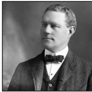
Francis Edwin Overall died in 1951 and is buried in the Overall lot at Magnolia Cemetery. Neither of his former Government Street homes survive.

City directories indicate that the Overall house vanished in the late 1950's to make way for expansion of