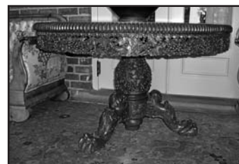
Massive Chinese Export Table in Bellingrath Home.