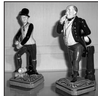
Porcelain Figures of Sam Weller and Mr. Samuel Pickwick