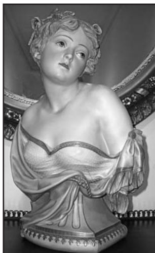
Porcelain Bust, Allegorical Of Summer.

At the end of the upstairs hall in the Bellingrath Home is a cabinet housing a collection of Royal Doulton figures which Mrs. Bellingrath purchased at Goldstein's when that jewelry emporium was still located downtown on Royal Street. In contrast to these modern (1939-1942) figures is the allegorical porcelain bust on top of the cabinet. This beautiful woman is "Summer," one of the four seasons sculpted by artist Owen Hale in 1881 and produced by Copeland and Co. of Staffordshire, England.