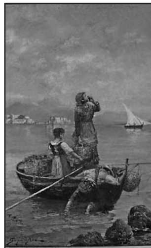
Oil Painting Of The Bay Of Naples.