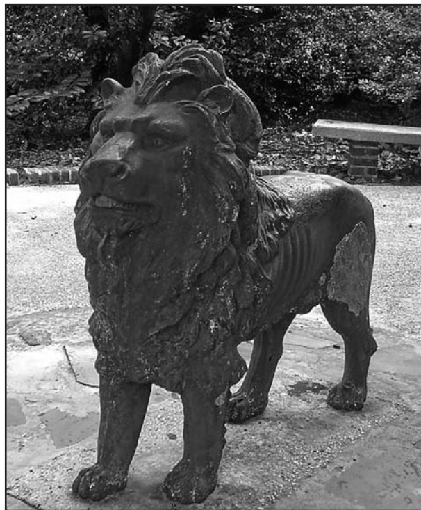
Majestic Cast Iron Lion at Bellingrath Gardens Since 1930.

The lion which is nearly six feet in length is attributed to the Philadelphia firm of Robert Wood & Co. which produced a nearly identical version for that city's centennial celebration in 1876. As early as 1852 ads for Robert Wood & Co. appeared in Mobile newspapers offering "Iron Railings, Statuary, Greyhounds, Lions, Hat Stands, Tables and Settees."