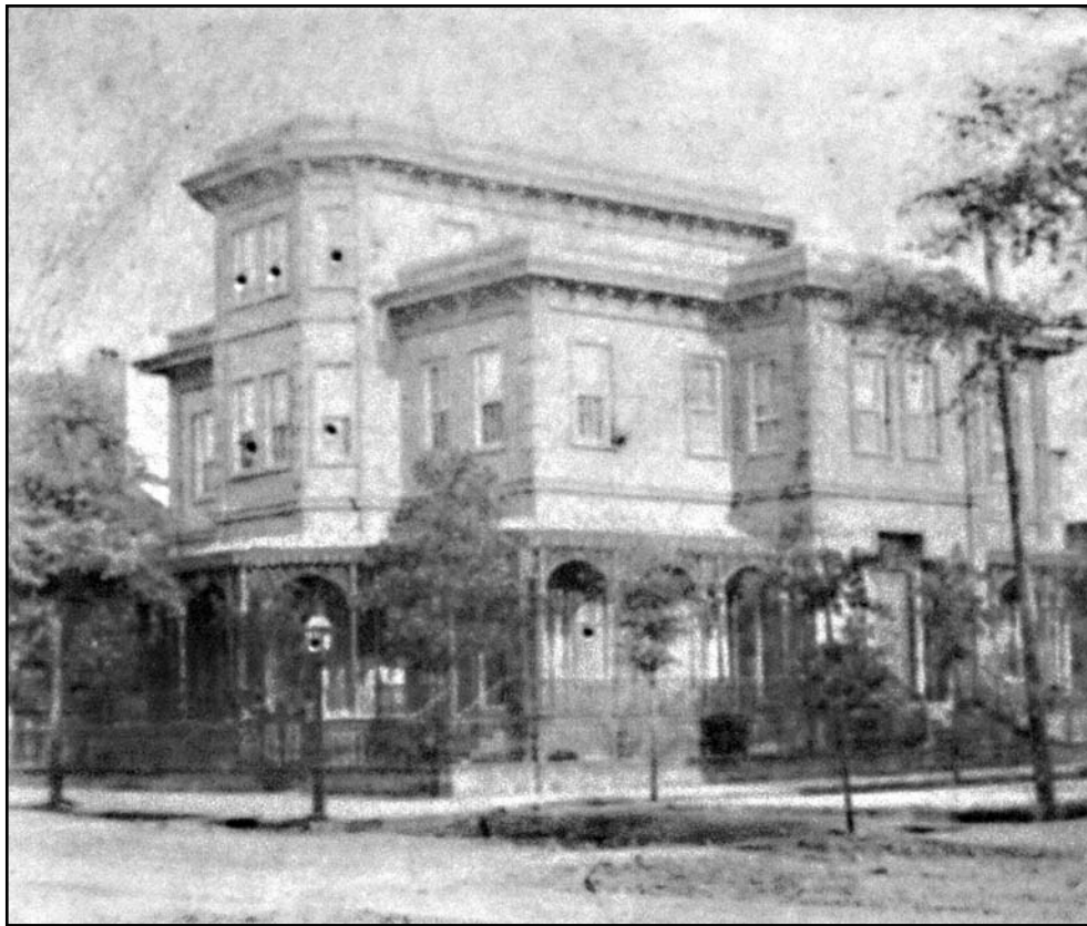
The William Ketchum Mansion (Ca. 1870)