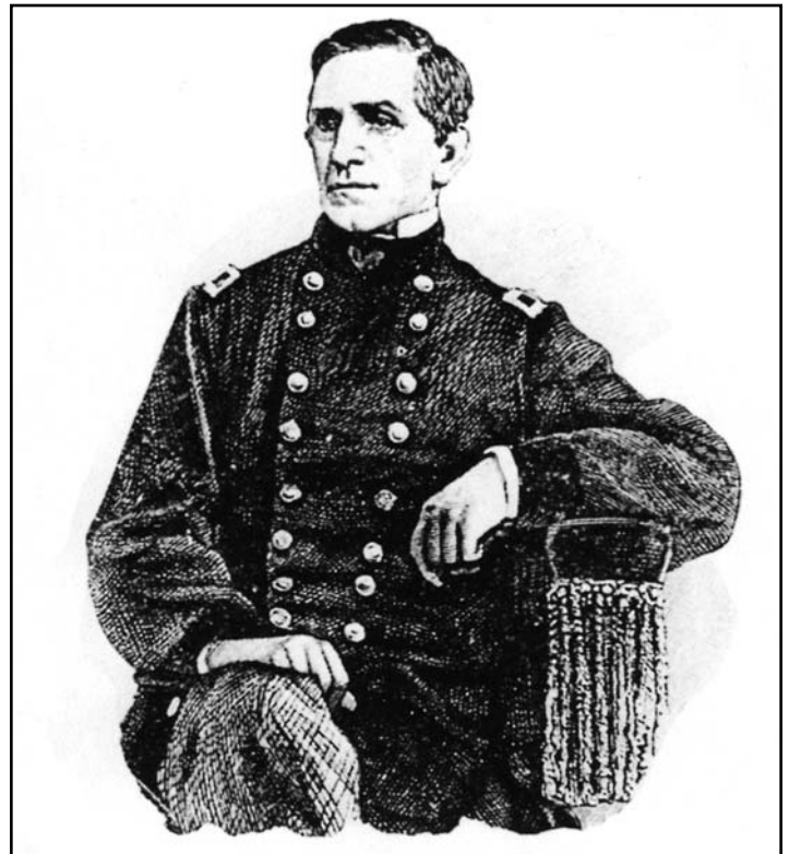
Maj. Gen. E R. S. Canby, U.S.A