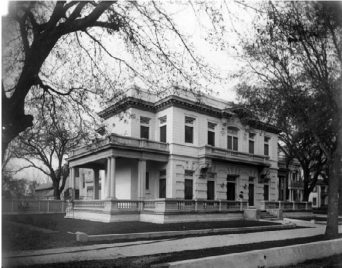
The Clarke House at 1060 Government Street, ca. 1902. Subsequent owners would spend fortunes to obliterate this classic French design.