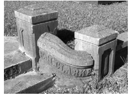
Detail of the stairs leading to the Clarke gravesite.