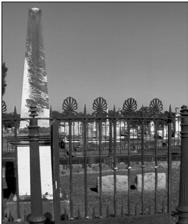
The Henry Hitchcock Lot at Magnolia Cemetery with its handsome gate and the late judge's obelisk visible to the left.