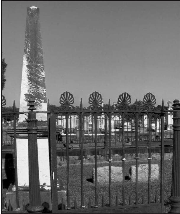
The Henry Hitchcock Lot at Magnolia Cemetery with its handsome gate and the late judge's obelisk visible to the left.