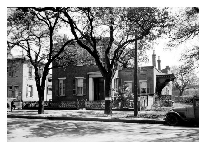
The Waring Home stood at the south west corner of Government and Claiborne streets for nearly a century. Waring added the one story wing to the west to house a large dining room with a canopied balcony overlooking a side garden. Despite having six children, the house only contained three bedrooms. Descendants remained here long after their neighbors had escaped an avalanche of commercial intrusion.

Moses Waring's wife, Ellen died later in 1870 and was buried in the family plot at Magnolia Cemetery. She was 59 years old.