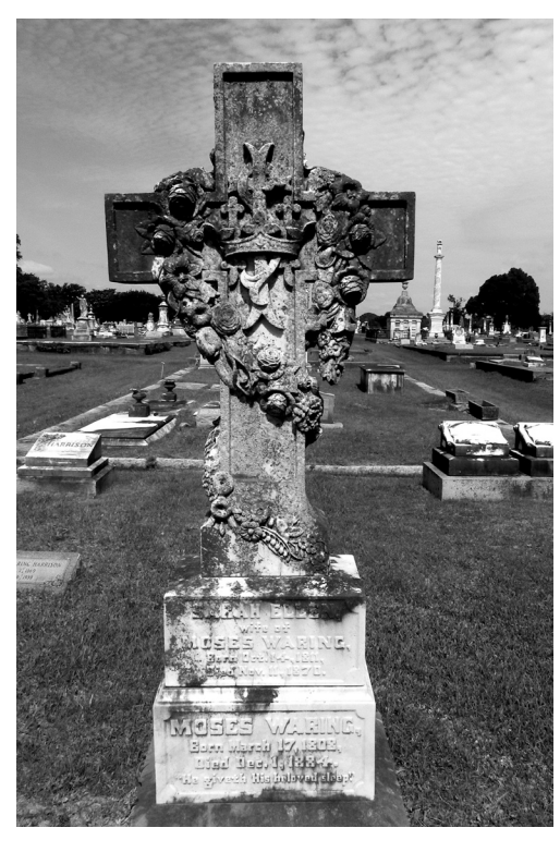
Waring Lot, Magnolia Cemetery

The parlor and library still contain their mid-nineteenth century furniture and the Gothic Revival table which Detroit now treasures is visible among the ancient floral carpet and peeling wallpaper.